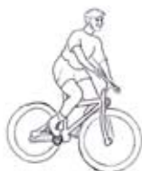
ride / cycle